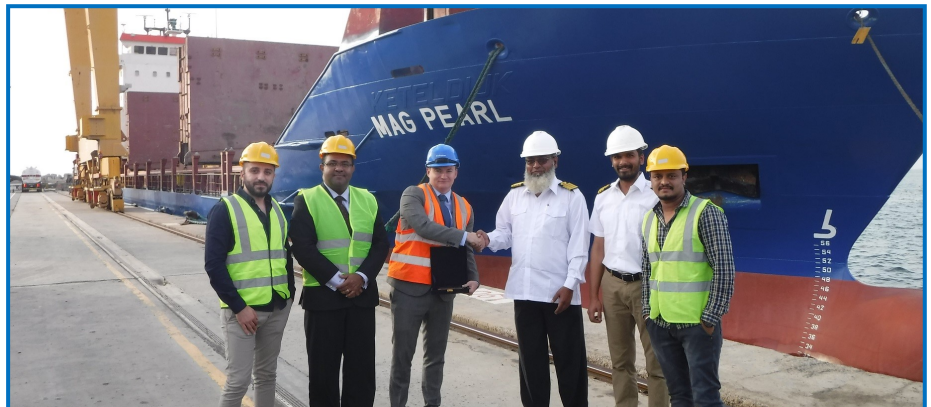
GT management welcomes MV MAG Pearl to SCT