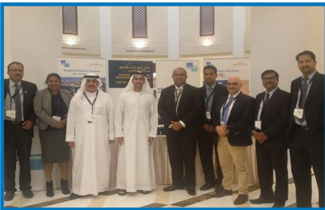
GT team supports investment forum

Gulftainer joined the Sharjah FDI, Invest in Sharjah and the Chinese Business Council, to discuss the Sharjah–China "Belt & Road" at the Sharjah Chamber of Commerce. The event highlighted new partnerships and investment opportunities being made available in the emirate to Chinese businesses which can provide existing and new investors from China direct access into local UAE markets through Sharjah, and to then enable further growth in their regional and global operations.