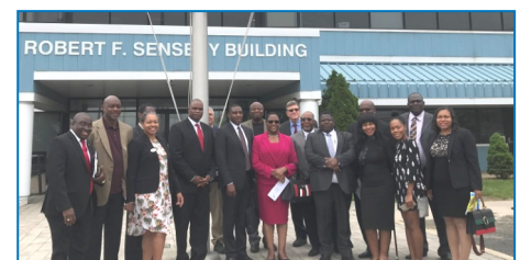
Namibian delegation visits Port