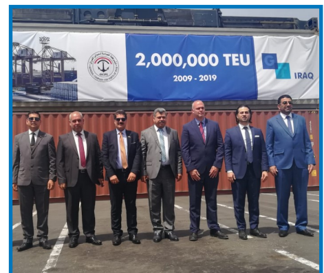
Gulftainer employees (left) and Iraq Port Authority officials (right) celebrate cargo handling milestone