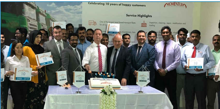
Momentum employees celebrate major milestone

Momentum Logistics has celebrated 10 years of delivering outstanding services to customers. The company, which was initially established as a support to Gulftainer's terminal operations, has evolved to become so much more in its own right. Since its inception, the company has expanded its scope and secured independent logistics contracts around the world. Headquartered at