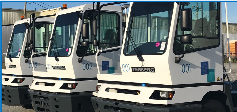
Terberg tractors now operational at the Port of Wilmington

GT USA Wilmington has taken delivery of the first 3 of an initial order of 16 terminal tractors from Terberg Tractors Americas. The equipment, which is low-emission and fuel-efficient will be introduced in a phased manner, with delivery of the remainder of the order scheduled for August and October 2019. "We are eager to take delivery