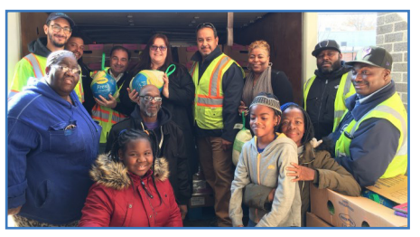
GT Wilmington donates 300 turkeys to families in the nearby community for Thanksgiving celebrations