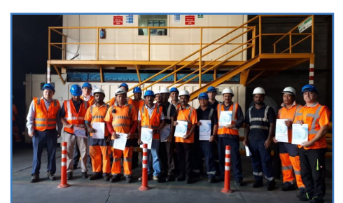
SCT Training graduates

Gulftainer is very focused on ensuring the safety of their employees in the workplace. One of the best ways to meet their legal and moral obligations to their employees is to provide first-aid training to those employees. First-aid education stresses the importance of practicing safety at all times to prevent accidents and emergencies. An increased safety consciousness helps employees to work carefully and avoid accidents, directly making the workplace a lot safer. An effective management system, that can be used to save lives when an accident occurs, involves training the employees to know the basic first-aid techniques. The use of first aid applies to all kinds of working environments even in the offices. First-aid education can save lives in situations of an employee falling ill or being involved in an accident. Managers and supervisors in each type of workplace situation are expected to be highly proficient when it comes to the administration of first aid for minor accidents and severe emergency situations. With this knowledge, supervisors will be in a better position to protect the employees in any situation.