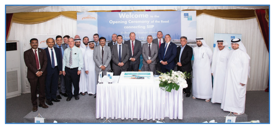
Gulftainer representatives and local officials attend the road opening ceremony

The 750,000-square-metre SIIP is set to become a fully bonded logistics facility with goods being imported under bond and remaining exempt from duty and VAT until released to the local market. SIIP will offer a degree of flexibility to accommodate warehouse spaces of varying sizes, modern light industrial units, offices, employee housing along with other