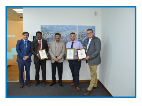
These awards also recognise organisations which have shown commitment to the wellbeing and mental health at work.