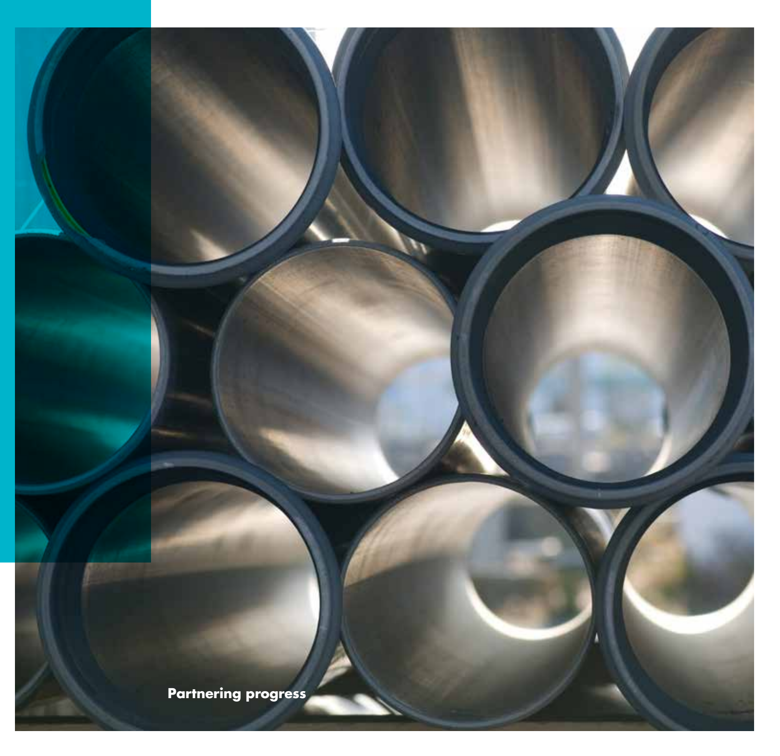
Iraq Project Terminal Umm Qasr, Iraq