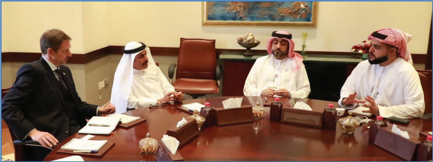
Gulfairer Team visits DED Sharjah

Gulfairer visited the Department of Economic Development in Sharjah to discuss the possibilities of enhanced cooperation going forward. The meeting jointly examined ideas on how to address those concerns and potential