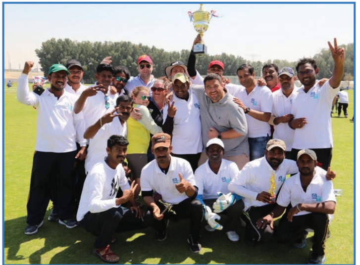
Gulfainer conducts an annual interdepartmental cricket competition. The teams played fiercely and the outright winners were Team KCT. Congratulations to the winners.