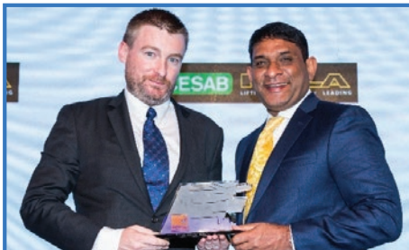
GulfTainer wins CSR Initiative of the year for Employee Wellness