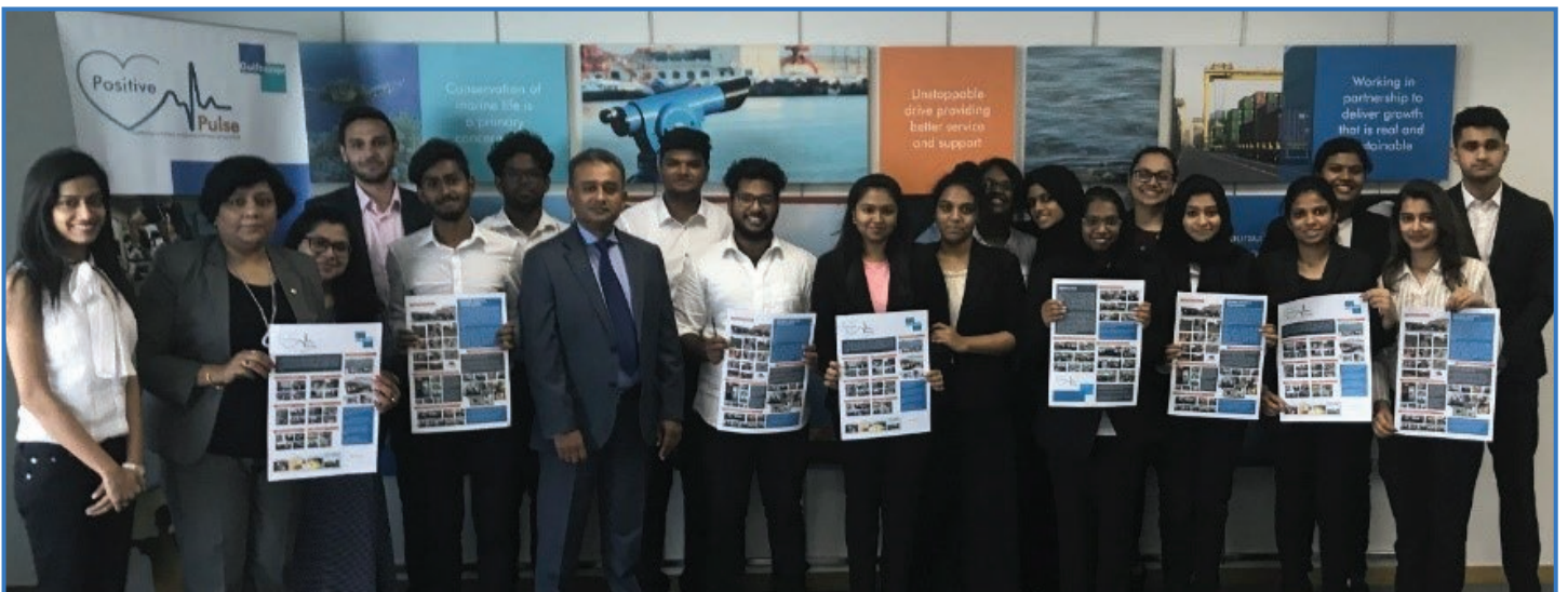
One of Gulfainer's four CSR Pillars is employability. In tie-up with Pearl Initiative, Gulfainer HR head facilitated a CSR awareness talk to Amity University students. The students then turned it into a case study about Gulfainer's CSR initiatives