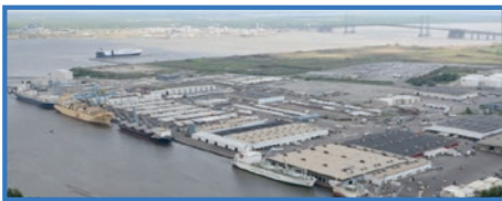
Port of Wilmington in Delaware, USA