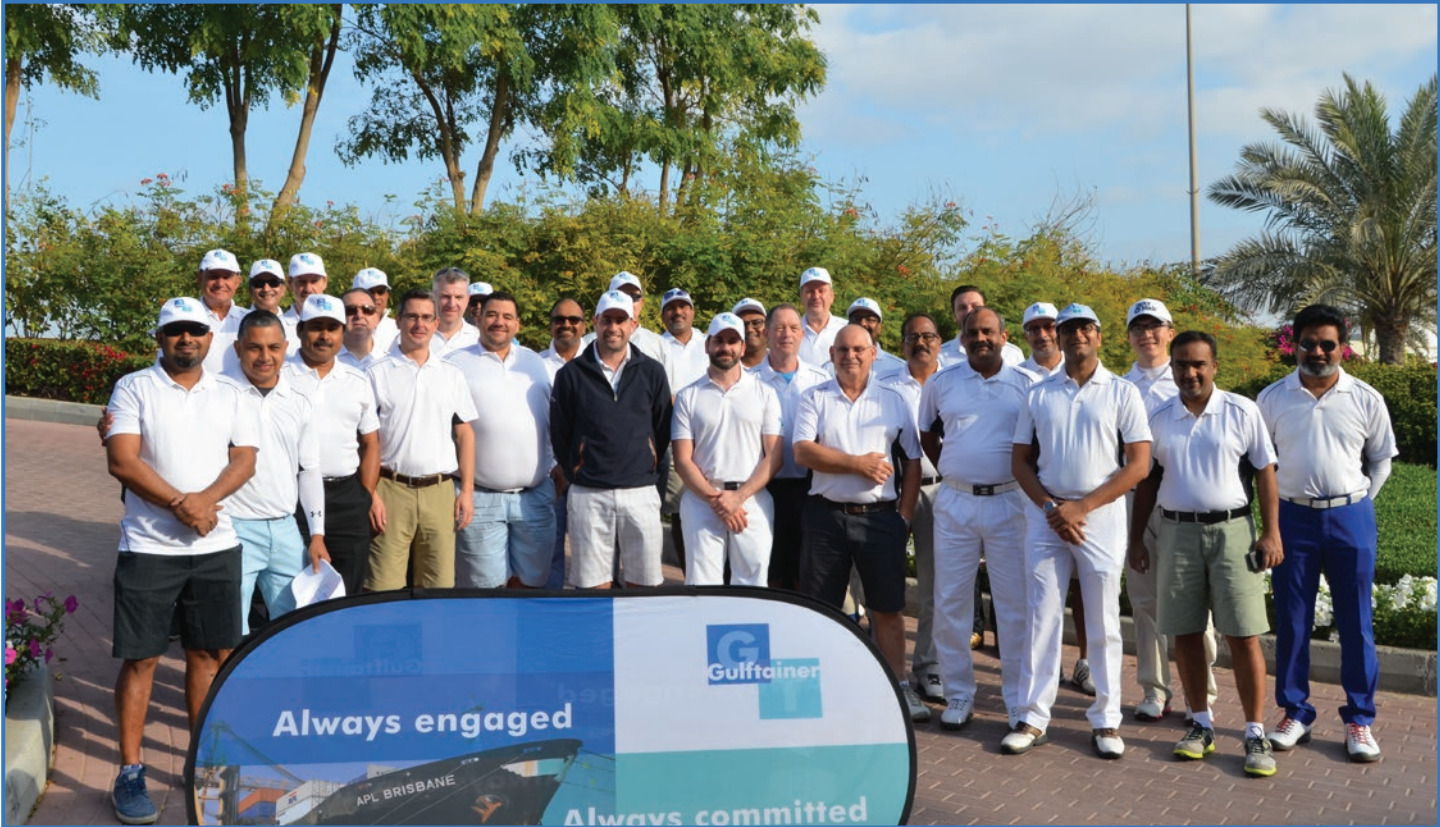
Gulfairer conducts its annual Golf championship for its customers to facilitate networking and enjoy a day off their busy work schedules. As usual, everyone had a great day of golf.