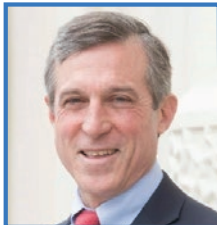
John Carney, Governor of Delaware

Gulfairer recently announced that its subsidiary GT USA has inked an agreement on terms with the State of Delaware, USA, which would grant GT USA exclusive rights to operate and develop the Port of Wilmington