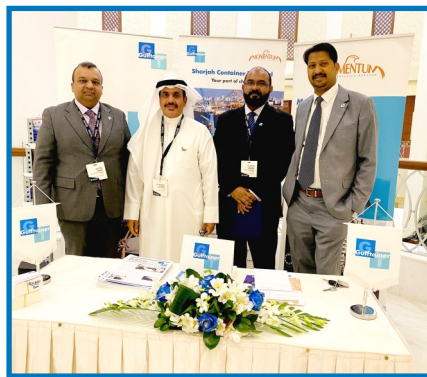
GT Commercial Team

The meeting introduced emerging prospects and potential investment opportunities in competitive sectors to investors from the Republic of Korea. While highlighting the sectors such as transportation and logistics, light manufacturing, travel and leisure, environment, technology and innovation, healthcare, education and