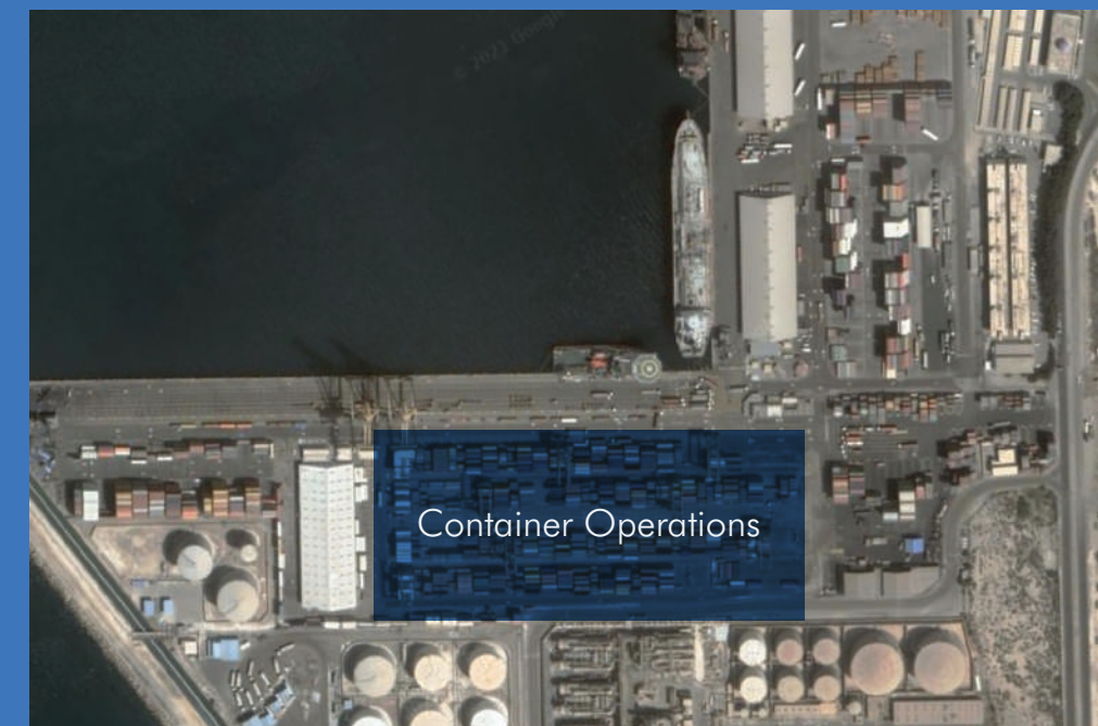
Satellite view of Sharjah Container Terminal

SCT launched an interim and complimentary 'Express Service Lane' initiative to prioritize the delivery of medical supply consignments at its ports across the UAE to support the nation's COVID response.